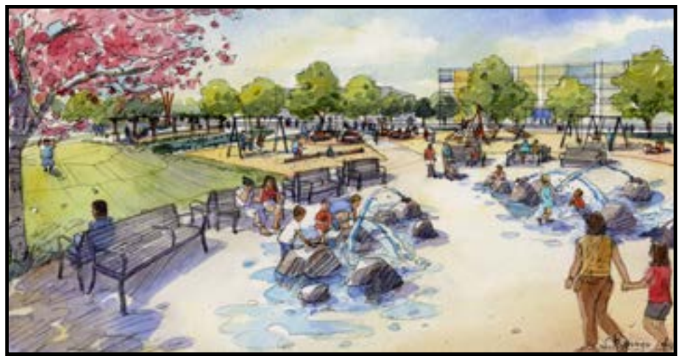
We hosted a lunch for legislators to thank them for their hard work and brief them on the next phases of the Sunset area plan.

We have made exciting progress in the Sunset Area, an area with low income levels and socio-economic challenges. We have created strong partnerships to completely transform the area. Our plan replaces distressed public housing with high-quality mixed-income housing and private development, invests in transportation and stormwater projects and provides neighborhood assets such as the Meadow Crest Inclusive Playground, Renton Highlands Library, and the Sunset Neighborhood Park.