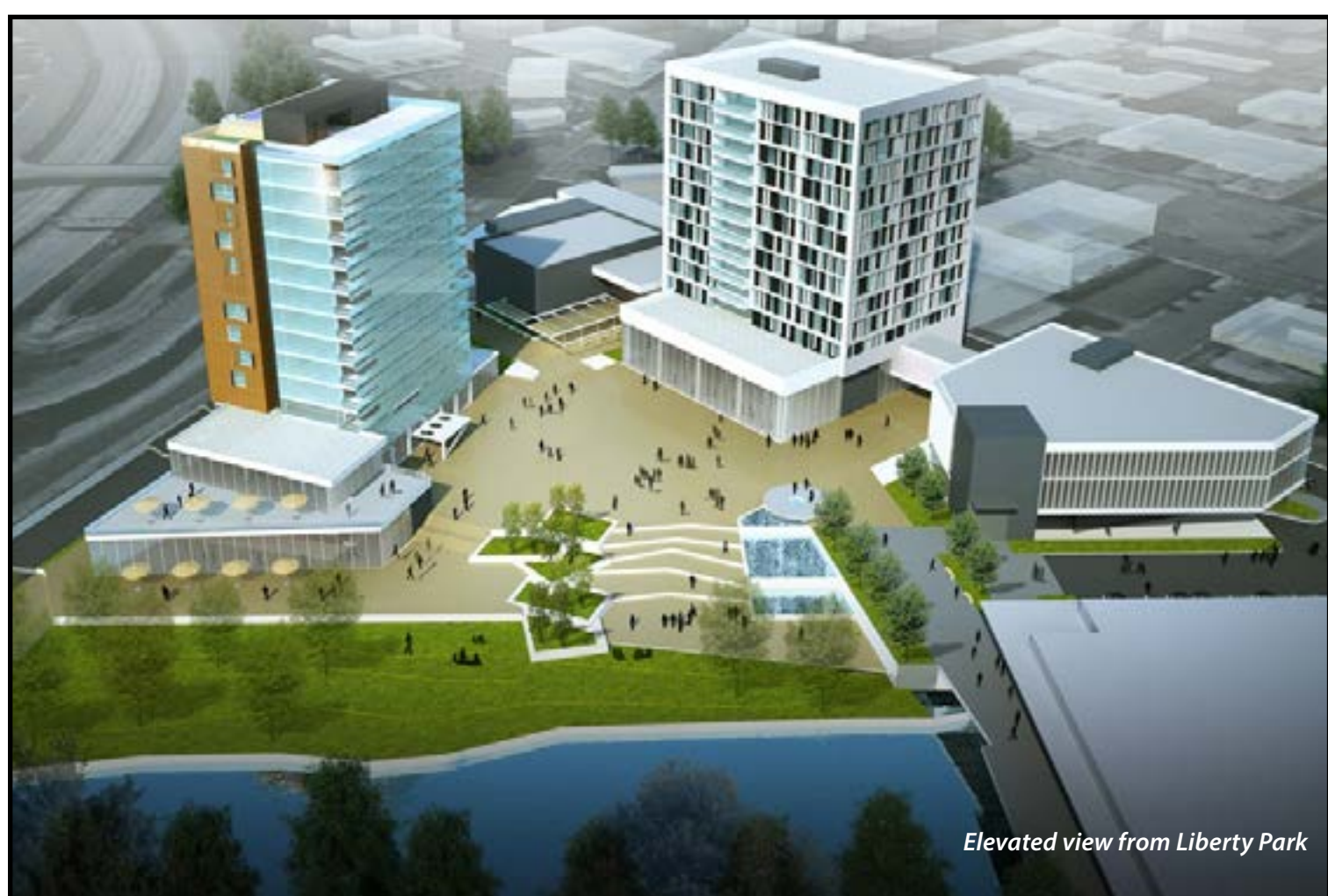
Elevated view from Liberty Park