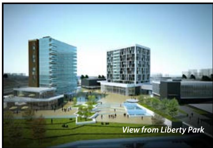
View from Liberty Park