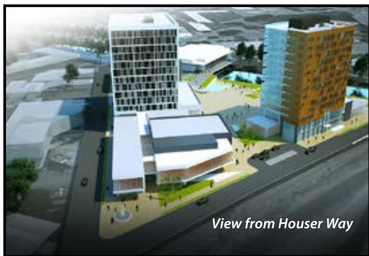
View from Houser Way

I believe the project will be the catalyst for further development in downtown while providing a much needed connection to the Cedar River and areas beyond the downtown business core.