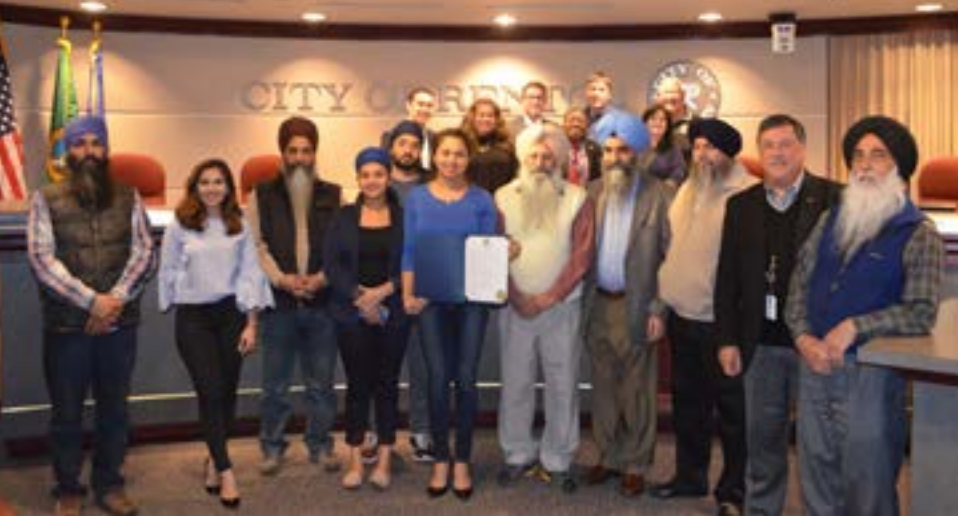
Members of Renton's Sikh community accept the mayor's

April is of particular importance to the members of our Sikh community as they celebrate both Vaisakhi, marking the beginning of the harvest season, and the Sikh New Year. The Sikhs contribute greatly to Renton, not just to our economy, but also by sharing their faith and culture. In