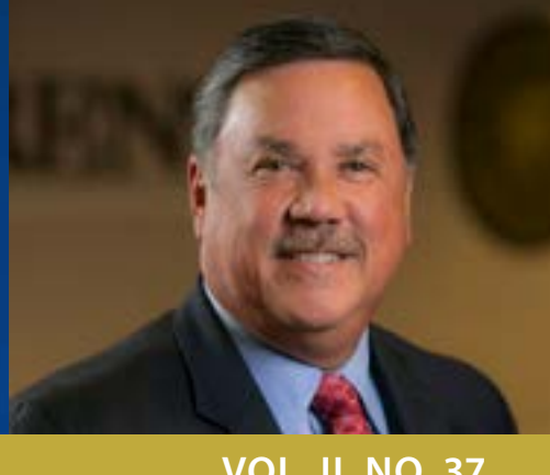
VOL. II, NO. 37